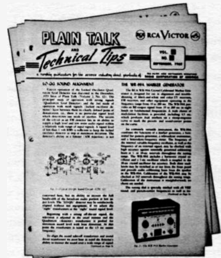
Figure 3—Plain Talk and Technical Tips

Monthly issues of "Plain Talk and Technical Tips" are included in RCA Victor service data subscriptions.