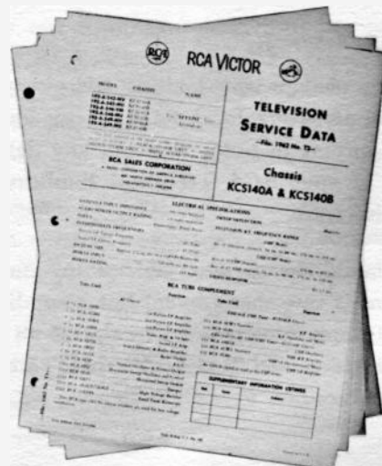
Figure 2—Television Service Data