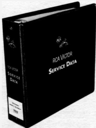
Figure 6—The Service Data Binder

The binder comes equipped with fiberboard paper risers which keep the service data from becoming bent and worn as it is subjected to the constant opening and closing of the cover. Service data may be re-