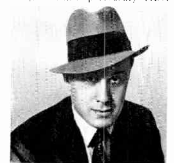
COLUMBO sings "Prisoner of Love," one other, in "Co. lumbo, Crosby, Sinatra" album,