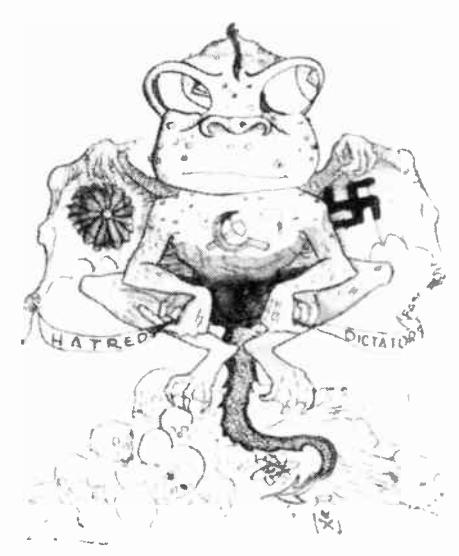
POLITICAL drawing, which shows "Thing" as dictatorship, intolerance, hatred, etc., is by Vugustus D. Moore of Atlanta.