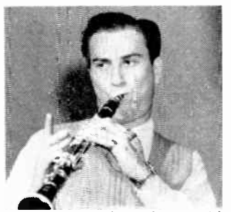
FRANK SINATRA sings "Night ARTIE SHAW is in 2 sets with and Day" & "Lamplighter's Sere-"Nightmare" and "Smoke Gets nade" in Columbo, Crosby—" set. in Your Eyes" (Gramercy Five).