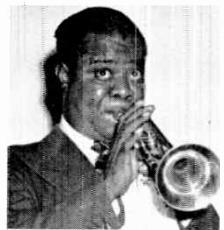
LOUIS ARMSTRONG'S "Sleepy Time Down South" is in "Theme Songs" set in Pop Treasury series.