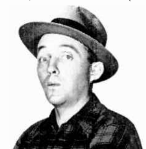
BING CROSBY'S "Just a Gigolo" and "I Surrender, Dear" (with Gus Arnheim) are in series.