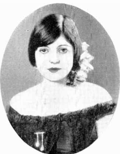
editor of "Metronome," makes his com- ment in Baltimore, left the Met in 1936. ments beginning on page 12. (For a com- & Currently, some of her fans are attempt-