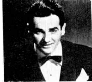
on his two