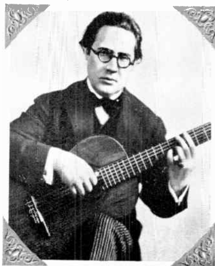
ANDRÉS SEGOVIA, says Cyrus Durgin, music critic of the Boston Globe, "is beyond question the greatest known player of the guitar, in the classical style, of our time,"