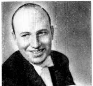
his own "Honeysuckle Rose" in back, "Heartaches," is another "Keyboard Kings of Jazz" album, unforgetiable disc in Treasury.