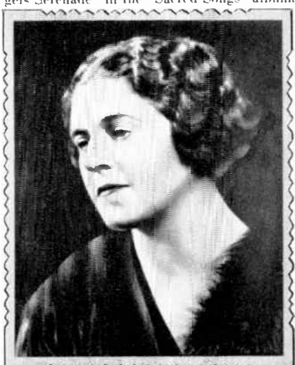
LOTTE LEHMANN, besides being in "Wagner" album, also sings 3 "Der Rosenkavalier" excerpts in "Composer's Favorite—" set. Strauss personally coached her in the role.