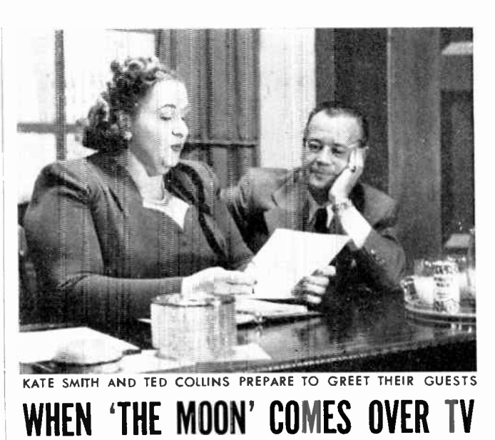
almost any owner of one of the first radio sets could tell you immediately that