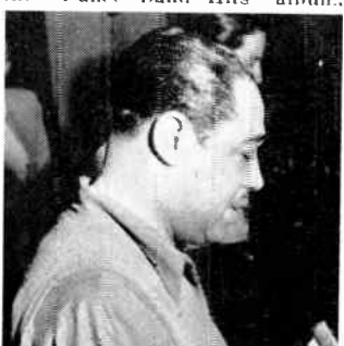
DUKE ELLINGTON has 3 sides in Pop Treasury: "Mood Indigo, ...A. and "Solitude." Train"