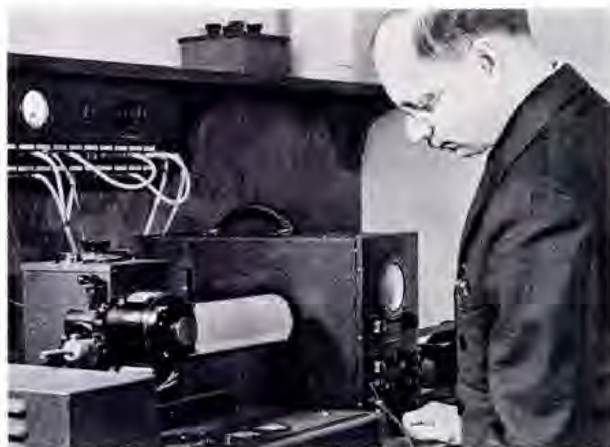
Broadcasting words and pictures. RCA facsimile equipment is now being used experimentally to broadcast exact reproductions of pictures, news bulletins or text matter of any kind. Photo shows "scanner" in act of sending.