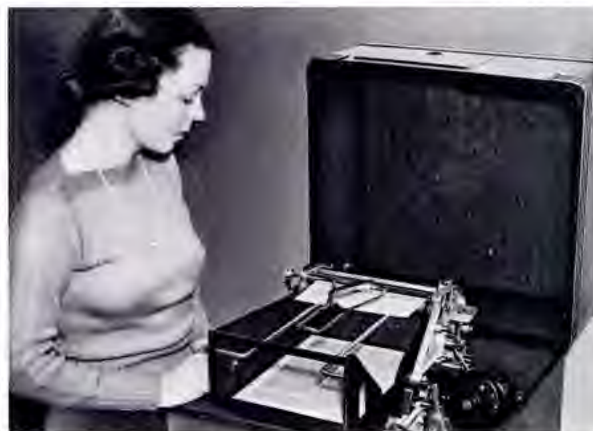
Receiving words and pictures. RCA facsimile receiver is about the size of an RCA Victor radio console. Such a receiver is shown here. It will print on a roll of paper the matter being sent out from the scanner.