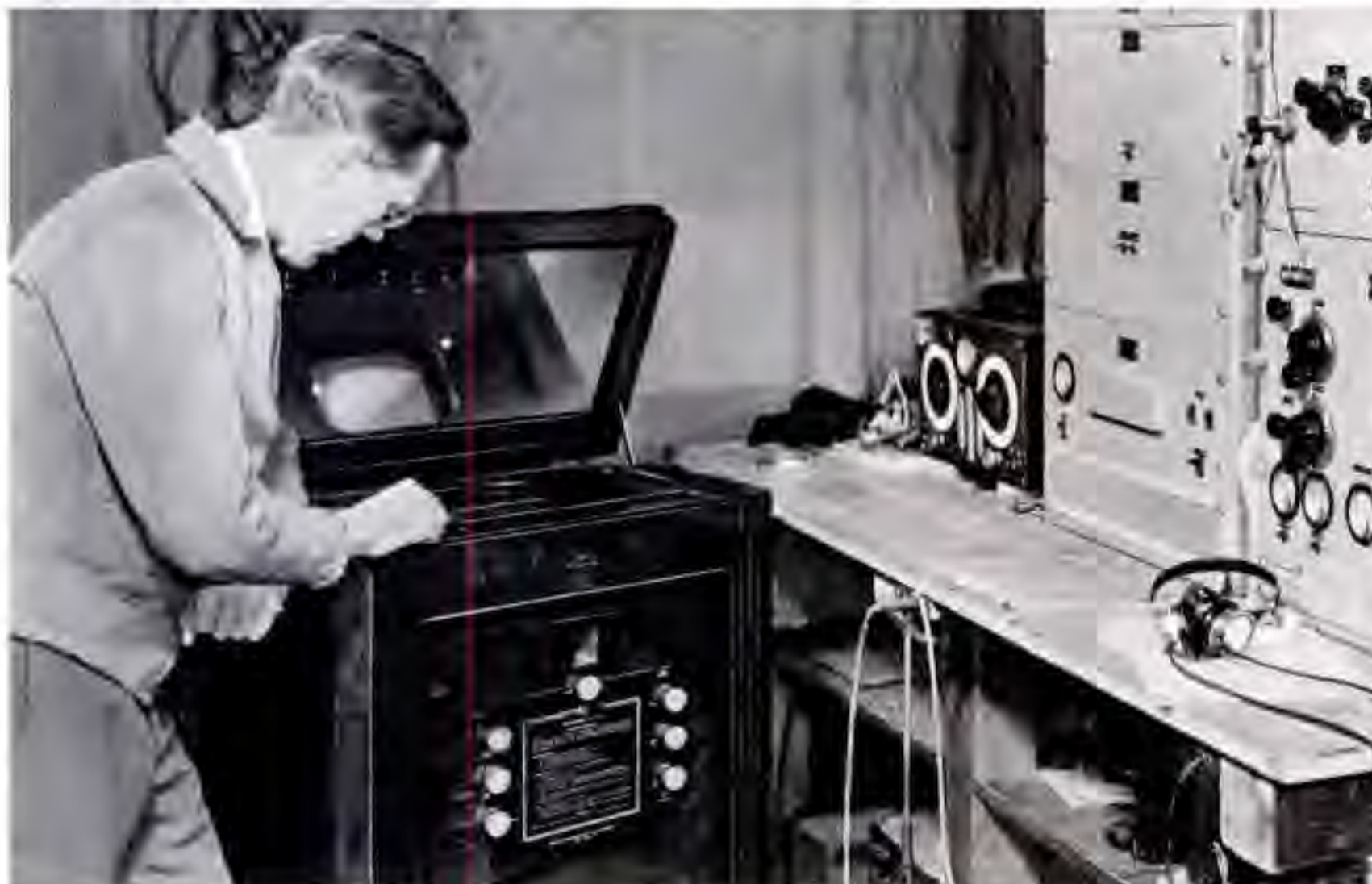
Another radio frontier. Recent television tests suggest that its satisfactory broadcasting may be limited to a radius of about 40 miles. But RCA engineers, always impatient with apparent limitations, are determined to investigate this matter further. They built the super-sensitive receiver shown above. This was connected with a special antenna at Riverhead, Long Island. The sound signals from television programs in London are clearly heard on some occasions. So far, no pictures have been caught. What these experiments may mean in the future of television no one can say as yet, but they well illustrate the constant endeavor of RCA engineers to push the frontier of radio knowledge farther forward.

The actual uses of radio ideas, so far developed, are amazing, yet a start has scarcely been made. Today's radio research men are like explorers camped on the edge of a vast and unknown continent. Nearby lies the work they have accomplished to date. But beyond are unexplored reaches which are a challenge and an inspiration. As these mysteries become clear the welfare of mankind will be greatly advanced. Indeed, so vigorous among sciences are radio, and its associated art of electronics, that their future possibilities cannot be estimated.