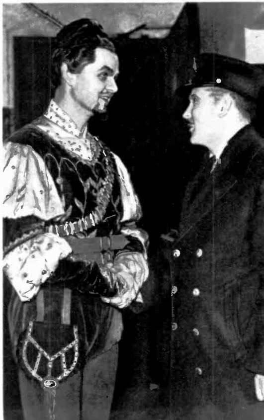
Otello and fireman. Lawrence Tibbett chats with fireman backstage at the Metropolitan. You can hear the entire opera "Otello" on Victor Records, and there are, of course numerous recordings of Mr. Tibbett in a wide variety of the operatic and popular songs he sings so splendidly.