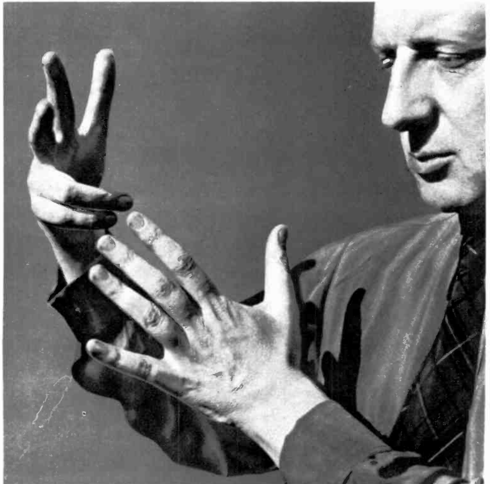
Hands without baton. Leopold Stokowski, famed conductor, leads without a baton, relying on the motions of his expressive hands. Among most popular

Victor Records are many recordings of the Philadelphia Symphony Orchestra under the direction of both Stokowski and Eugene Ormandy.