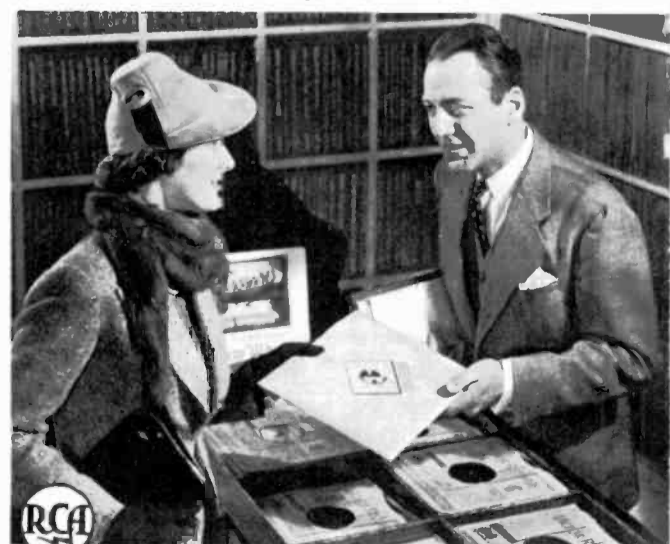
Libraries of Enjoyment are being built by millions of music lovers who find Victor Records suit every mood. For newest idea about records and record playing see next page.

RCA RADIO CORPORATION OF AMERICA RADIO CITY, NEW YORK NATIONAL BROADCASTING CO. - RCA INSTITUTES, Inc. - RCA COMMUNICATIONS, Inc. RCA MANUFACTURING CO., Inc. - RADIOMARINE CORP. OF AMERICA