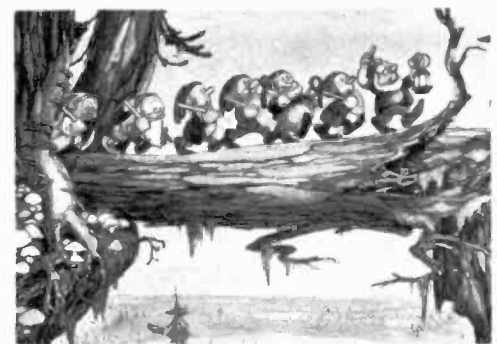
Best selling album today is the Victor collection of songs from "Snow White" (price $2.25). These entrancing melodies, like the picture itself (which is recorded and reproduced by RCA Photophone), have won a host of admirers.