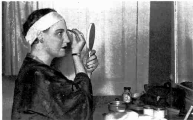
Star makes up at Metropolitan. Kirsten Flagstad prepares for the role of Sieglinde. Another of Mme. Flagstad's famous roles is that of Brünnhilde, and one of the best selling and most beloved of all Victor recordings is Brünnhilde's War Cry "Ho-yo-to-ho."