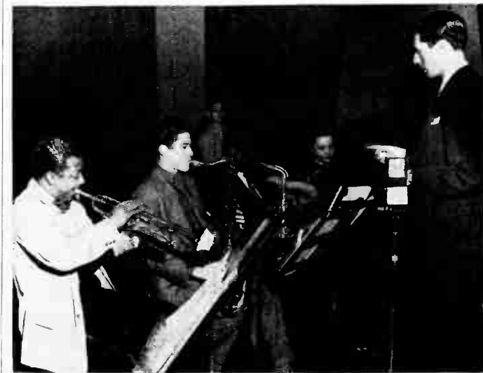
LEONARD FEATHER AND MEMBERS OF COLEMAN HAWKINS' BAND A slow, rhapsodic style.

Hawkins left Henderson soon after perfecting his style and went to Europe to play in the elaborate band of Jack Hylton, England's top handleader at that time. For five years, Hawk toured Europe, recording in many countries, finally establishing himself in Holland where he made his famous recording of "Meditation," a tune dedicated to him by a Dutch trumpet player. He returned to this coun-