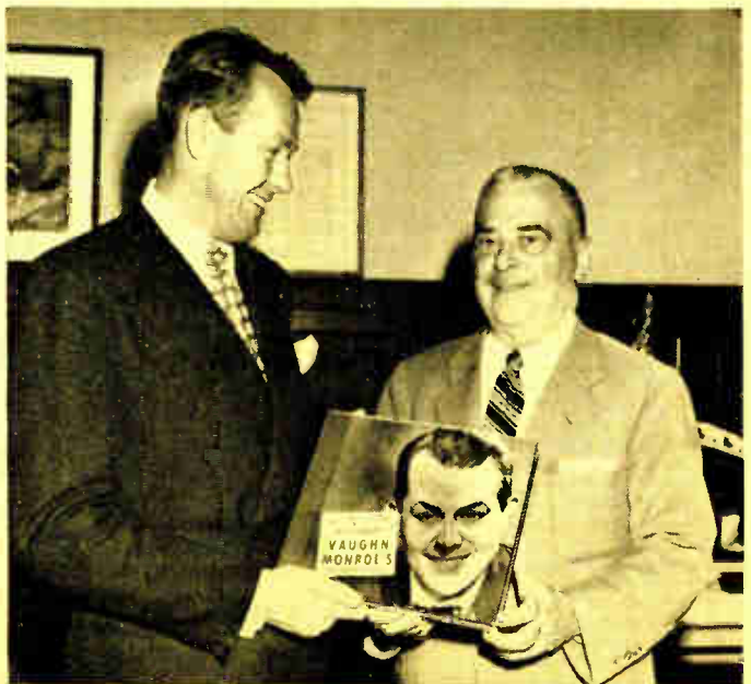
VAUGHN MONROE AND MAYOR SAMUEL Vaughn presents Mayor Samuel of Philadelphia with one of the first copies of his "Dreamland Special" album. The event occurred while Monroe was playing at "The Click."

The combined efforts of Stan Kenton's band and the King Cole Trio, plus the movie, "Blue Skies," recently broke all existing records for opening day at New York's famed Paramount Theater.