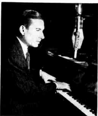
HOAGY CARMICHAEL His Sunday show over CBS is one of the new, good programs.

And all these fresh, new, young bands, all this expanded activity in almost every direction is bound to have but one result. That is that more and more people are daily being exposed to good jazz (Continued on page 9)