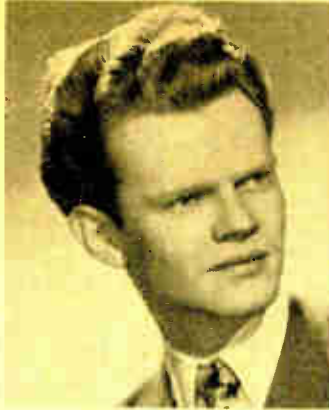
BOBBY NICHOLS A share of the credit.

The King Cole Trio will make another picture when they journey to Hollywood next month. The so-far untitled movie will be made by Paramount.