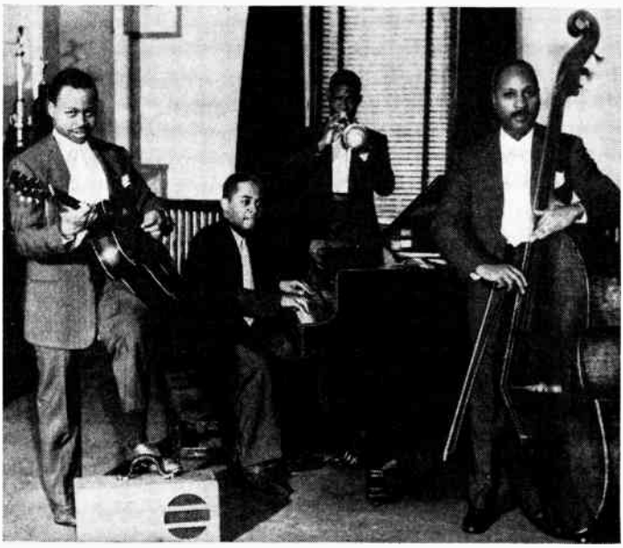
THE ARISTO-KATS This hip group of four made its premier on RCA Victor records a short time ago. It is meeting with success everywhere.