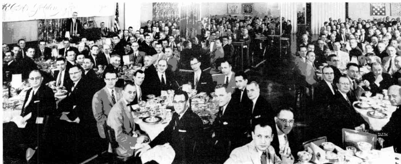
Over 350 Cherry Hill managers attended last month's General Sarnoff-Golden Achievement Year Dinner at the Cherry Hill Inn where the three CH Divisions were awarded plaques for the efforts in 1955