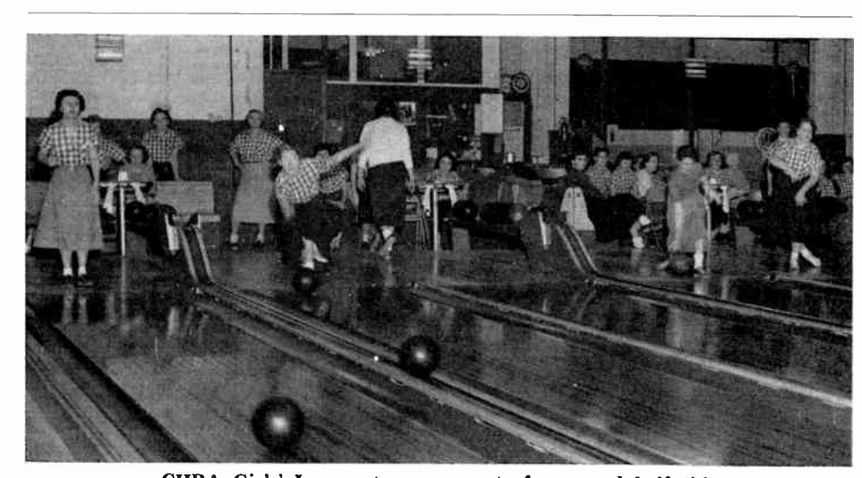
CHRA Girls' League teams compete for second half title

All leagues bowl on Monday evenings at the Haddon Lanes alleys. The second half, which began in January, will end late in May.