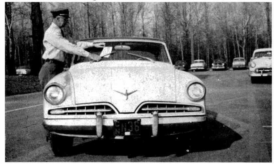
Lt. Funck places violation notice on employe's car for illegal parking

Licensed automobile drivers have the same responsibility to abide by traffic rules, regulations and signs on RCA property as they would on the open highway. Where roadways and parking areas are available for public use they are subject to the police power of that municipality.